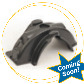
Side Port Coupler