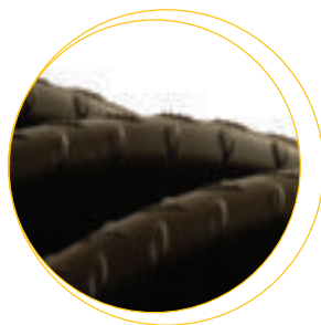
Diamond Plate Texture